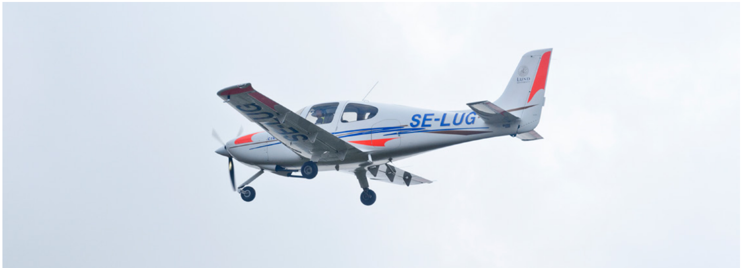
One of Lund University School of Aviation's planes.