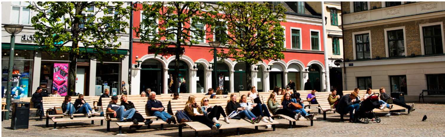
The rest benches on Stortorget.