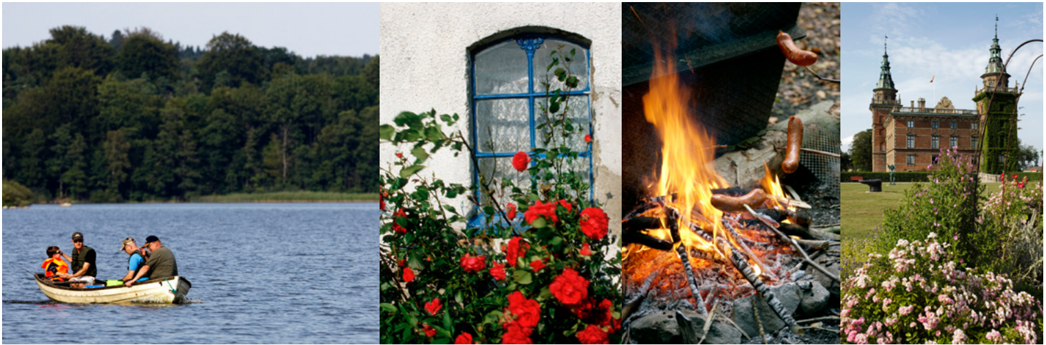
There is beautiful nature and many places with old origins that you can experience in Skåne.